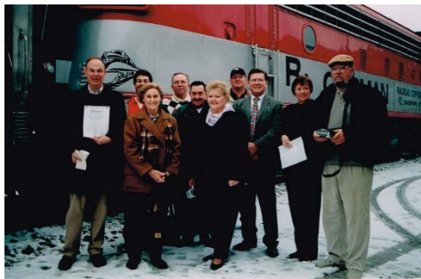
Chapter group before boarding.

For charity trips out of Clarksville on January 29, 2000, R.J.Corman brought their "My Old Kentucky Dinner Train" from Bardstown and we got a chapter group together to go over there and ride it. The recent snow was still on the ground and it was a frigid evening. But we had a delicious dinner and a good time, altho the train didn't actually go very far (it sat on the Cumberland River bridge while we ate). It was pulled by Corman's ex-Southern Railway FP-7s and a GP-16 was on the rear to pull us back.