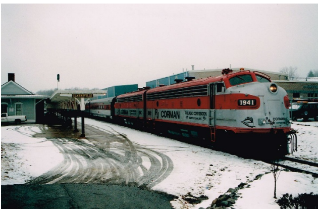
Train at the Clarksville station awaiting a 5 PM departure.

You simply cannot go wrong by adding this one to your collection. This is probably going to be the video that I share with you guys the next time I am scheduled for entertainment but don't wait for that; get one ordered for yourself. I promise you, you will watch it over and over again.